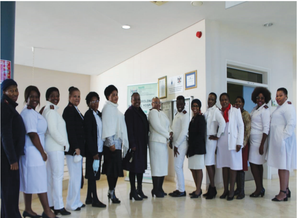
The Team that organised, and motivated the JMMH nurses on their special day