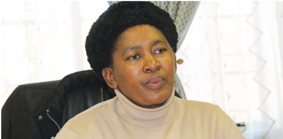
The School Head of Bopaganang Secondary School says the school is excited to celebrate its Golden Jubilee

For contributions and any correspondence please call, The School Head on 083 7577 827