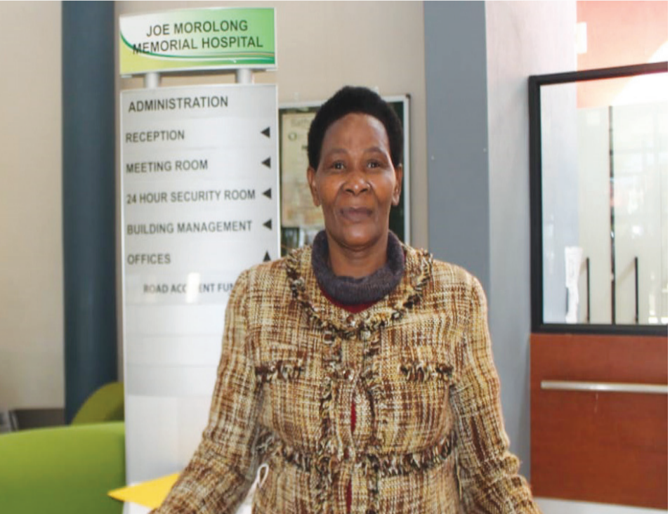
Ms Mokalake offered the word of support to the nurses