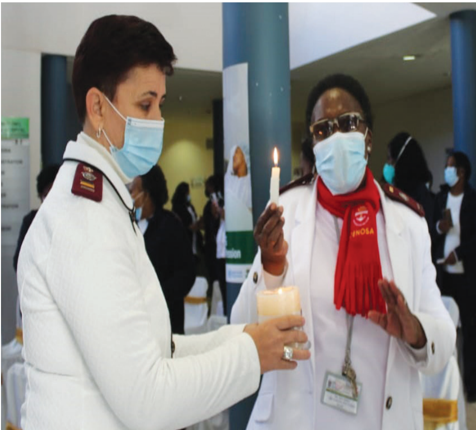
And then the candle was an ilumination moment to honor all the nurses for their wonderful work