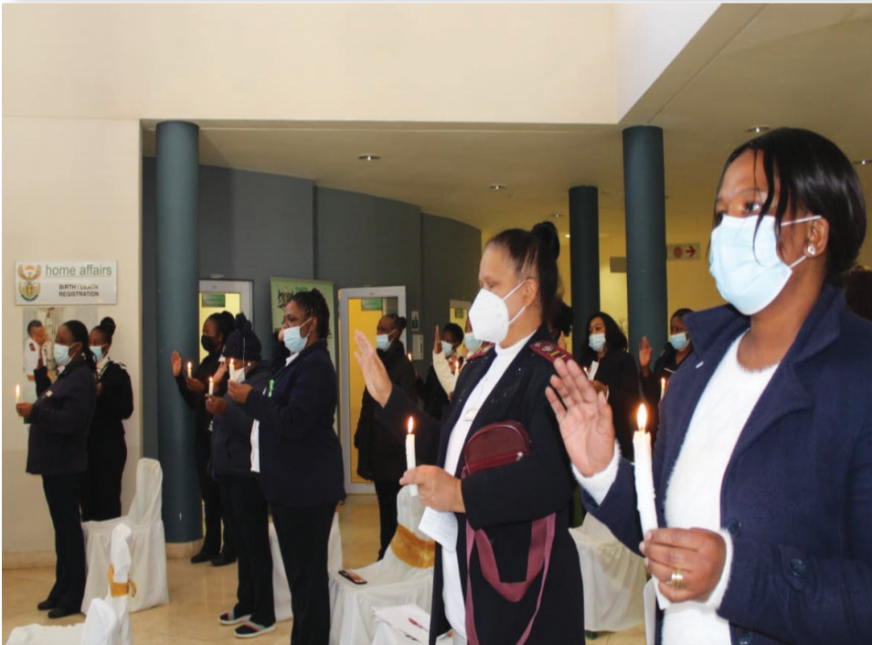
JMMH Nurses revisiting their pledge to serve with love respect and dignity