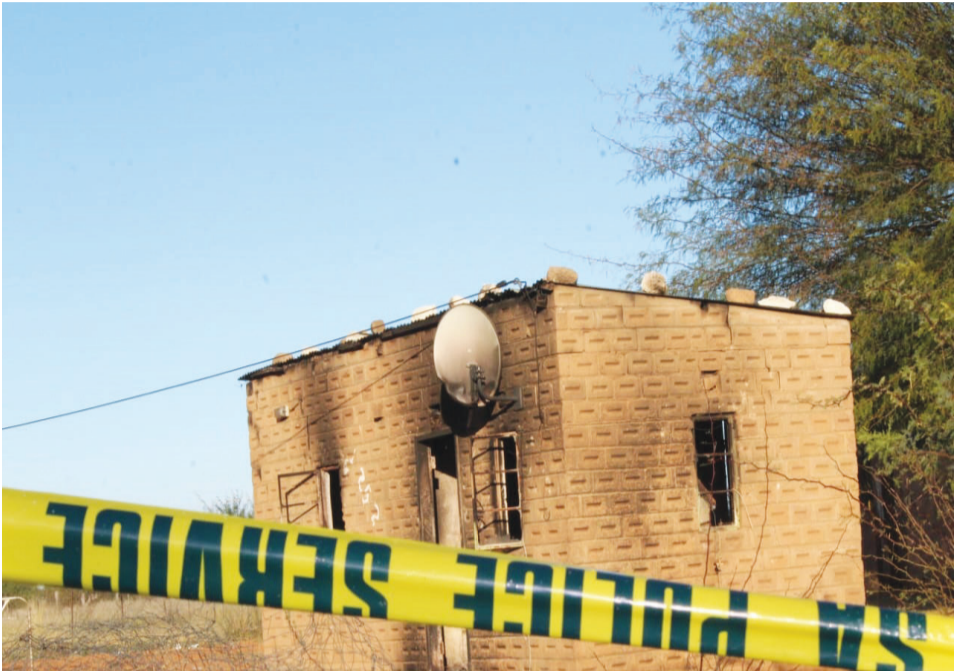
E, ke masalela a ntlo e go bolelwang baagi ba fiseditseng babelaelwa ba go gweba ka diritibatsi mo go yone kwa motseng wa Morokweng