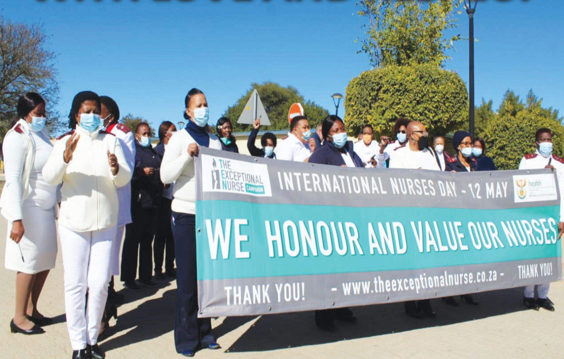
The jubilant JMMH nurses singing praises of their notable profession in celebration of the International Nurses Day.