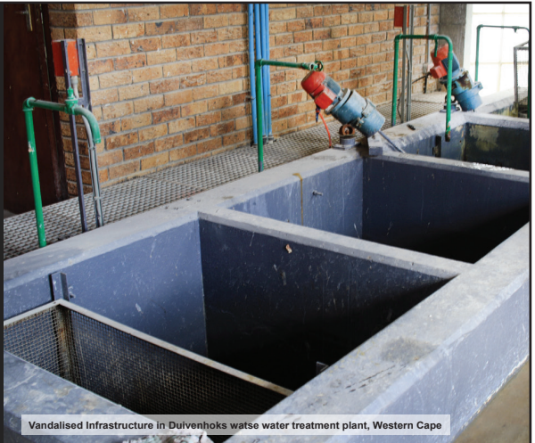
Vandalised Infrastructure in Duivenhoks watso water treatment plant, Western Cape

TO VANDALISE DWS INFRASTRUCTURE AND PROPERTY